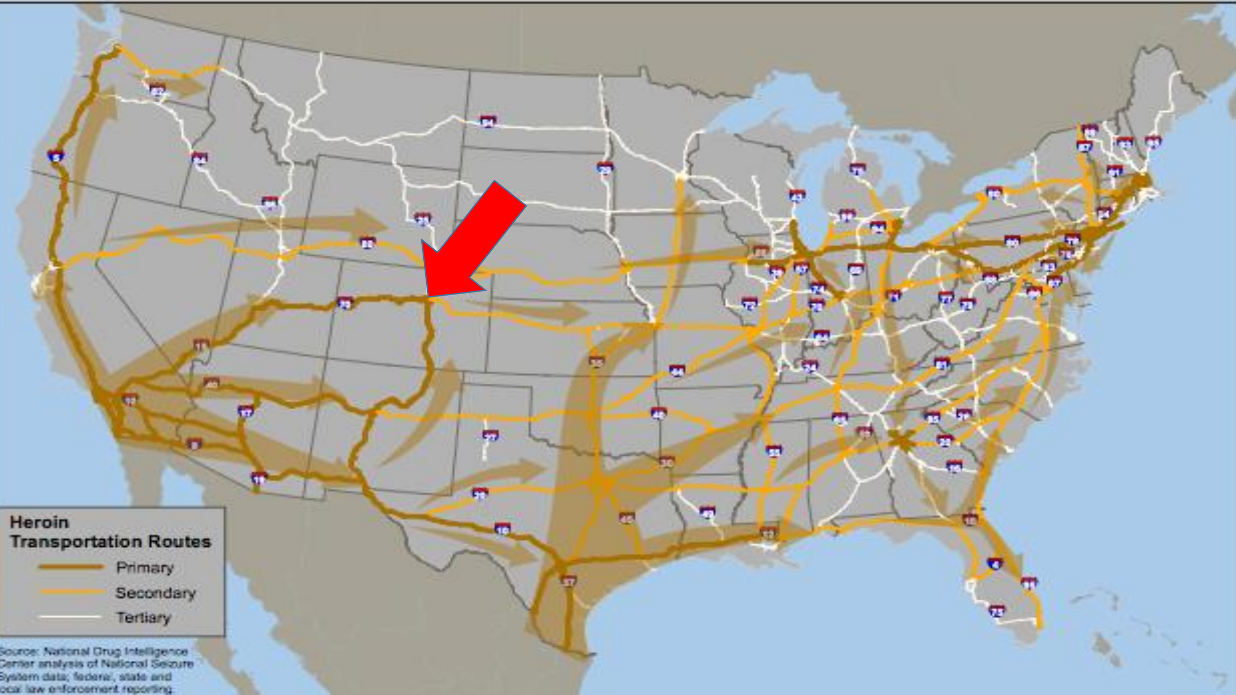
Heroin Transportation Routes Primary Secondary Tertiary