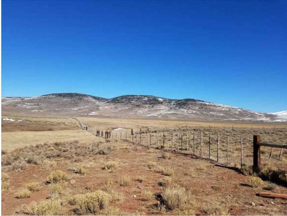
Typical open views on the Diamond Peak Performance Property.