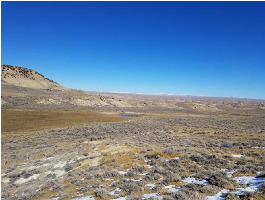
Sagebrush shrubland that provides excellent habitat for big game and hunting opportunities